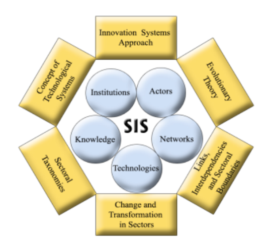
Figure 2: Theoretical Bases and Main Building Blocks of the SIS Concept