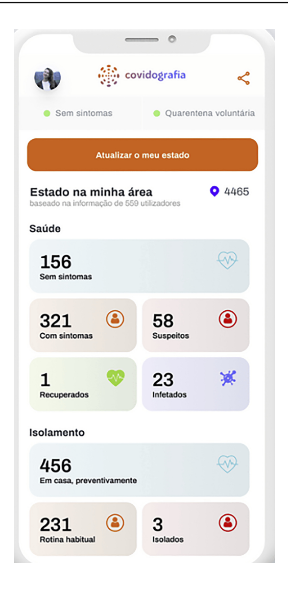
Figure 2. Covidography app

Tech4Covid had to pay special attention in the current panorama, while distance learning remains the main means of communication between teachers and students, there will be a worsening of inequality in access to education.