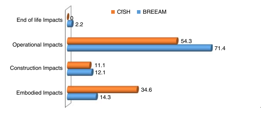
Figure 2. Environmental weight assigned to different lifecycle stages of buildings in BREAAM and CfSH

Figure 3 compares the percentage impacts of buildings over their entire lifecycle with the proportion of scores assigned to each stage in BREEAM and CfSH.