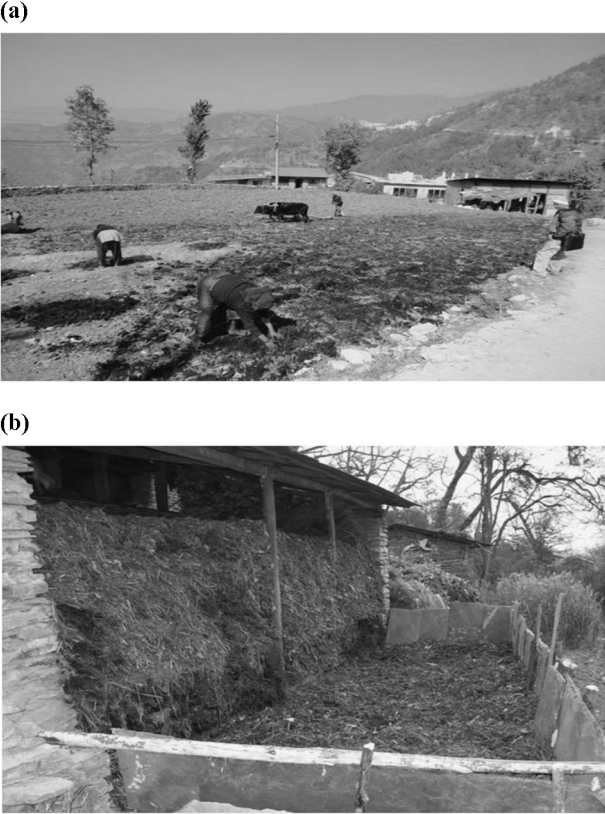
Plate 2. (a) Farmer mixing FYM in the field through ploughing; (b) improved management practices: FYM heap protected from sun exposure, rainfall and leaching