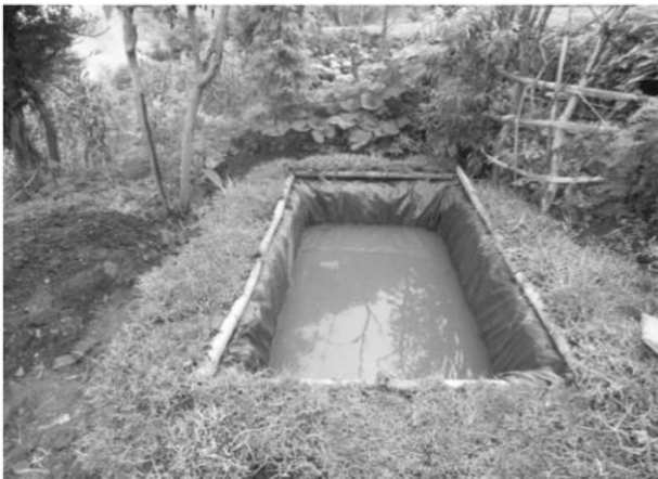
Plate 4. Water collection in simple pond for irrigating winter/ summer crops