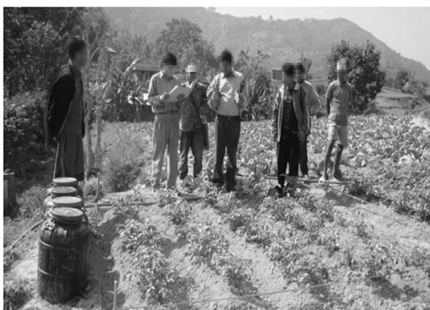
Plate 3. On-farm research trials on effectiveness of botanical pesticides for managing crop insect/pests