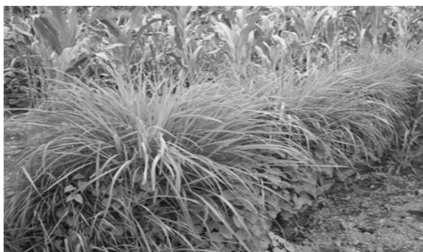
Plate 1. Forage/fodder production on terrace risers

recognised by the farming community as it has reduced the workload of women in fetching animal feed.