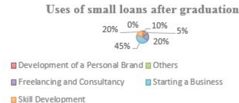
Figure 9 Use of small loans after graduation

A total of 45% of students want to start a business such as a bike shop, Argo farm, etc., 20% want to start freelancing and consulting, and 20% want to develop skills, with 10% developing their personal brand.