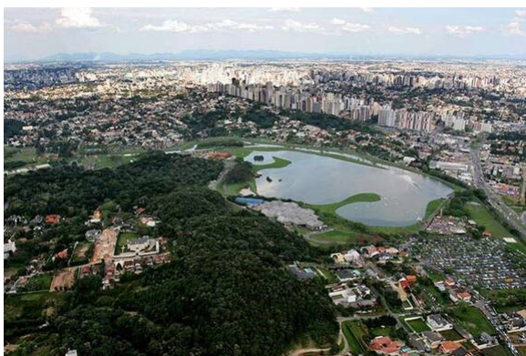
Figure 1 Curitiba City, Brazil

Curitiba is renowned for its efficient public transport system and green urban planning. The city's master plan integrates land use with public transport, reducing traffic congestion and pollution. The active participation of citizens in planning processes ensures that development initiatives meet local needs (Ribeiro, 2020).