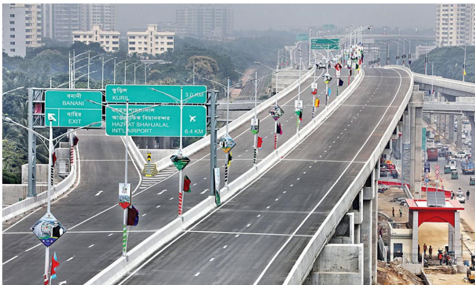
Figure 3 Dhaka Elevated Expressway

Multi-Modal Connectivity: Integrate the expressway with other modes of transportation, such as bus rapid transit (BRT), metro rail and existing road networks, to enhance connectivity and reduce traffic congestion.