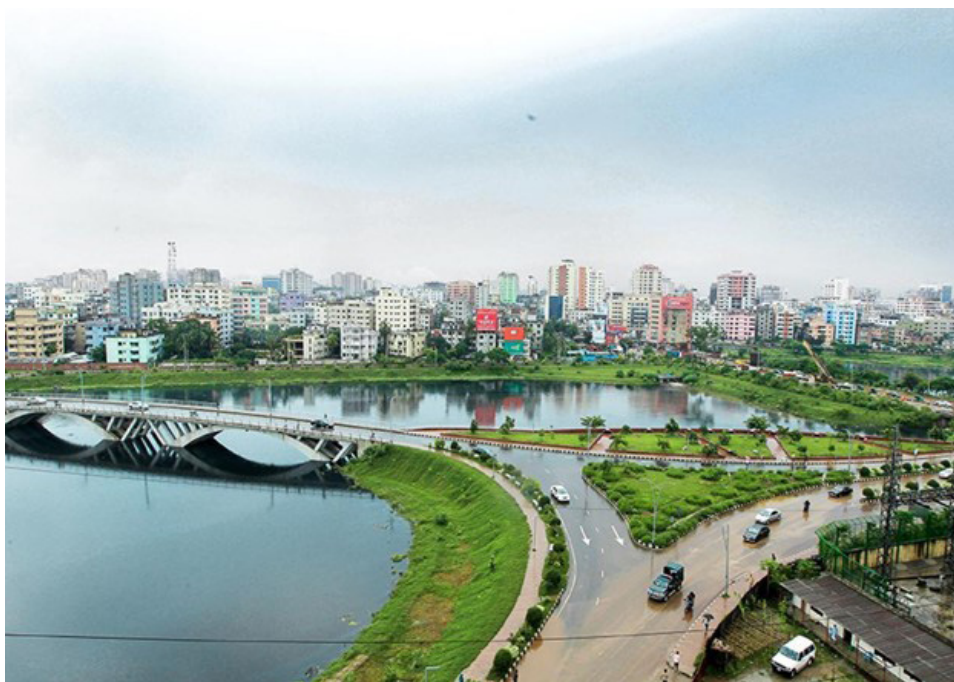
Figure 4 Hatirjheel-Begunbari Lake Development Project