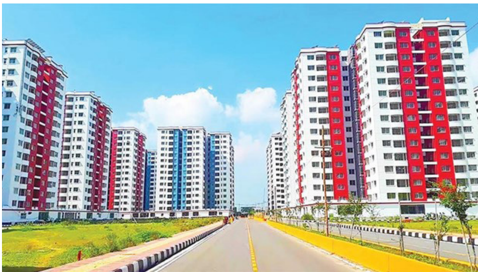
Figure 5 Uttara Model Town Development Project

Traffic Congestion: Increased population density has led to traffic congestion in and around the area.