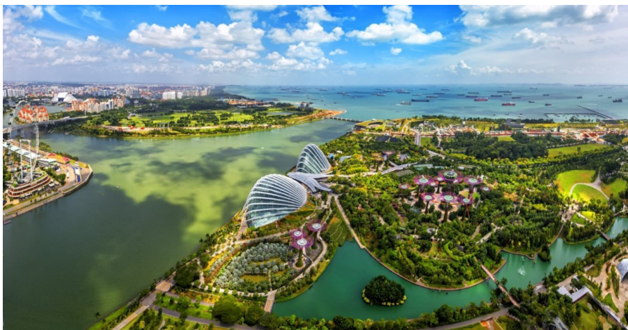
Figure 2 Singapore City (Partially)

In Singapore, the use of smart technologies for urban management, including traffic monitoring, waste management and energy efficiency, exemplifies advanced sustainable urban development. The incorporation of extensive green spaces and vertical gardens also enhances urban liveability and environmental quality (Rodgers, 2024).