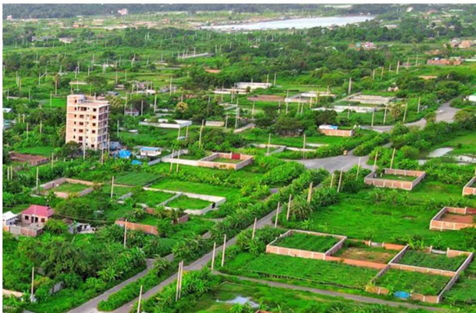
Figure 6 Purbachal New Town Project

Developing adequate infrastructure such as roads, utilities and public services in a new area is complex and resource-intensive.