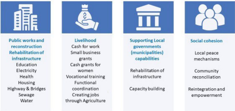
Figure 3: The Stabilisation Programme for Iraq

Iraq was devastated by destruction, displacement, and ruined infrastructure from the 2003 war. Reconstruction has been tainted by constant sectarian violence, corruption, and abuse of aid. Foreign investment has been enormous (Figure 3), but Iraqi reconstruction has been slowed down by poor governance and excluding local stakeholders from decision-making. Infrastructure reconstruction was given top priority while ignoring political reconciliation and social cohesion. PCR can be successful if co-operation among regional, local, and international stakeholders is enhanced, population engagement is heightened, and consideration of long-term sustainable development is prioritised. Proper damage assessment, involvement of the public, open government, and effective monitoring mechanisms are crucial for the success of PCR (El-Ashmawy et al. , 2024). Sudan has to conduct proper damage estimates, engage locals in project planning, and distribute resources evenly in a bid to avoid inefficiency.