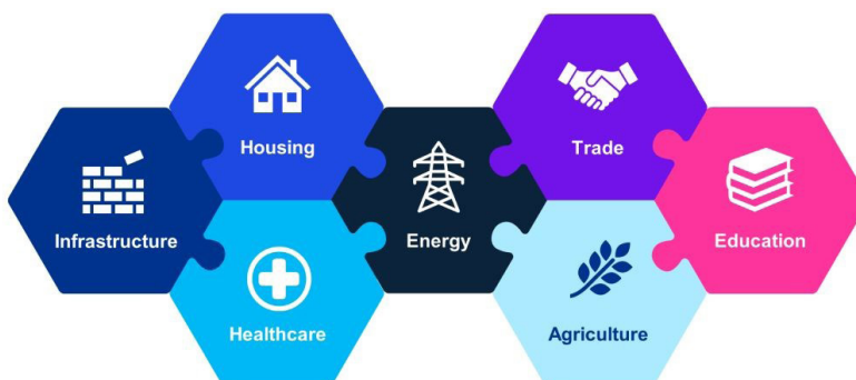
Figure 2: Key Sectors Necessary to be Included for Damage Assessment

PCR is an integrated activity that includes engineering, social, and economic activities. This section covers the engineering aspect of PCR of war-torn areas, i.e., sustainable urbanisation, and how engineering can contribute to making societies resilient. Drawing from global experiences, it emphasises the importance of long-term solutions and community involvement in rebuilding infrastructure and society. Effective damage assessment is a basic starting point in the engineering process of post-conflict reconstruction. This involves analysing the extent of damage to physical infrastructure (Figure 2). Correct assessments are fundamental in setting priorities, efficiently distributing resources, and ensuring that PCR is compatible with long-term resilience goals.