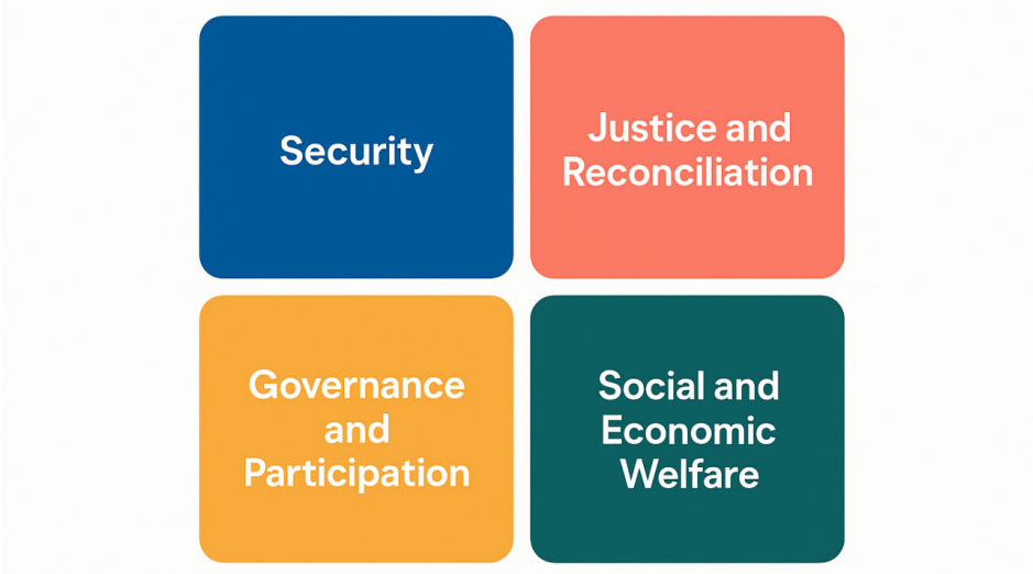
Figure 4: Pillars of PCR